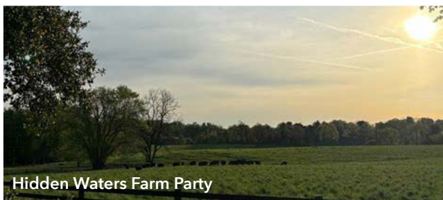
Hidden Waters Farm Party