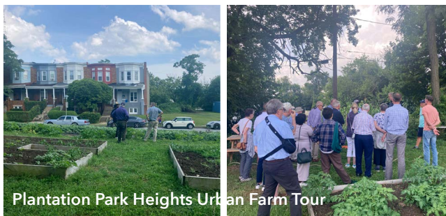
Plantation Park Heights Urban Farm Tour