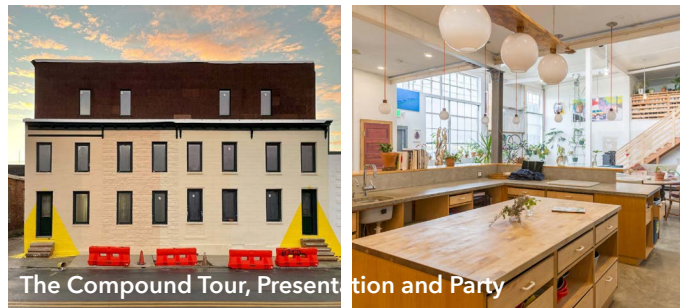
The Compound Tour, Presentation and Party